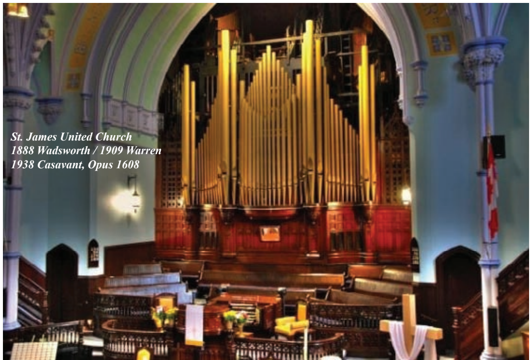
St. James United Church 1888 Wadsworth / 1909 Warren 1938 Casavant, Opus 1608