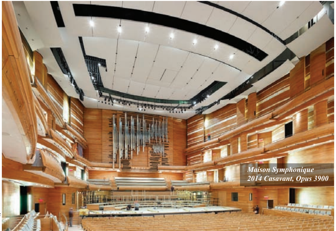
Maison Symphonique 2014 Casavant, Opus 3900

Bookings will be taken on a first-come basis for the first 20 participants, with priority for those taking bus transport. We need a commitment by May 1 st so we know if we have enough people for a bus. If not, we can advise those who wrote